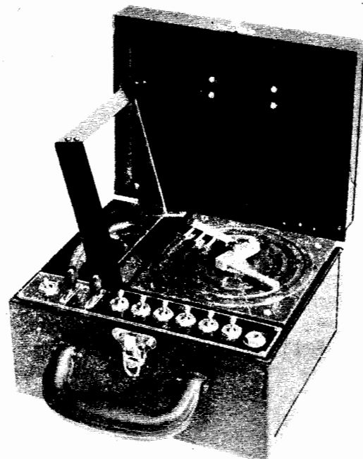
Fig. 1 - 100A Teletypewriter Test Distributor

1.02 The 100A teletypewriter test distributor may be used at outlying stations in connection with transmission testing between the station and the central office or assigned test center. It will also be found of use at a test center not having a permanently installed source of teletypewriter test signals. This set will also be required when orientation tests are to be made locally at a station disconnected from the loop. The signals produced by the 100A set are those required by the 161A telegraph station test set (Blank, T, O, M, V, LTRS), so that the 100A equipment will be particularly useful in connection with that set. The 100A set may also be useful with the 164C1 telegraph transmission measuring set and the 118-type telegraph transmission measuring set. The open and close sig-