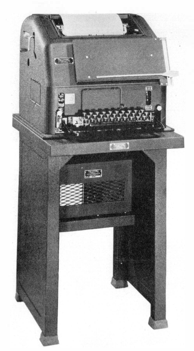
This No. 15 page printer is the basic teletypewriter unit.

cuits that have proved the efficiency and reliability of the system. Later, the service was extended to advanced base headquarters and to most AGC's. Although many TTY installations were only temporary and experimental, there has been sufficient information concerning them to precipitate a veritable deluge of requests for equipment. Elaborate plans are being made for the future of TTY in the Navy, and a program is already underway to automatically provide ships and stations with equipment as rapidly as it becomes available. The sudden demand for equipment so exceeds production, however, that no quantity shipments can be made until after November. By next year many ships will probably be able to copy all their Fox schedules by TTY, and special UHF harbor circuits employing TTY will provide all communication while in port.