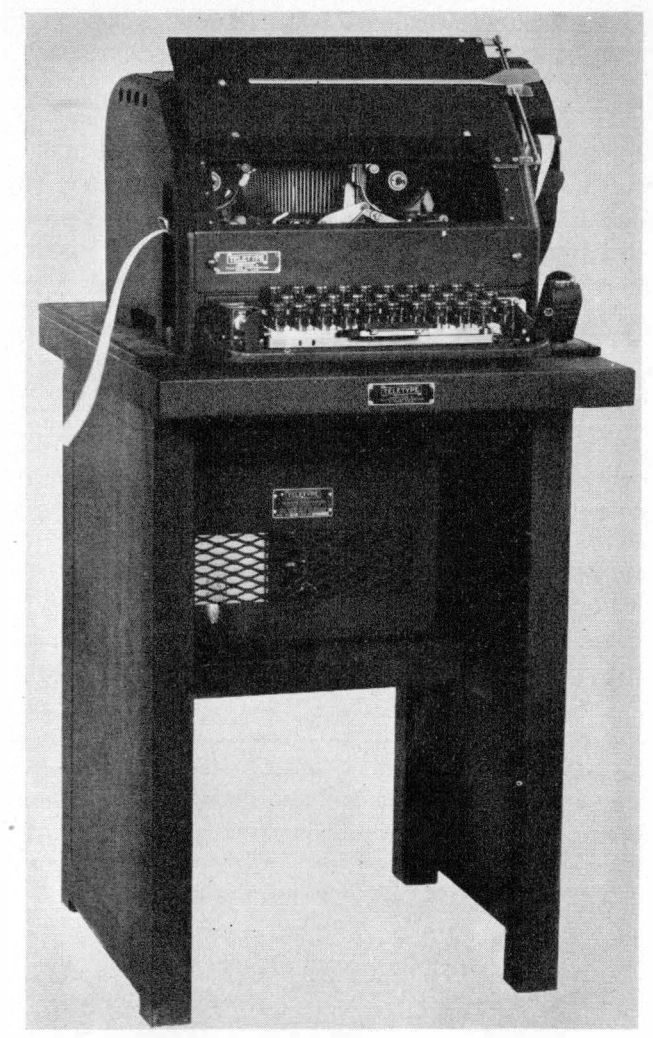
The No. 14 TTY is used to relay messages. The table illustrated is for shore-use only, as special anti-shock and vibration mountings are required aboard ship.

The converter serves an opposite function to the keyer, in that it converts the received frequency-shift signal back to the DC telegraph signal necessary to operate the TTY printer. Models FRA and FRG Frequency-Shift Receiver Converters are not yet available in final form, although an interim equipment, the FRC, is available in limited quantity. These equipments are