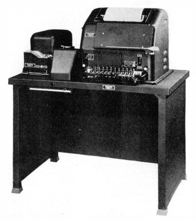
The No. 19 TTY Set includes facilities for perforating and transmitting tape.

As far as accuracy is concerned, TTY sending is as subject to operator errors as any other system. But when transmissions (or tape perforating) are monitored by the operator, it permits him to see, in plain language, an exact replica of the transmission. The TTY printer is inherently accurate, and will not introduce garbles unless they are present in the input signals. However, under conditions of difficult radio reception the TTY will naturally fail to produce perfect copy, as is the case with any other system. By the use of frequency-shift keying, the TTY is probably as good under these