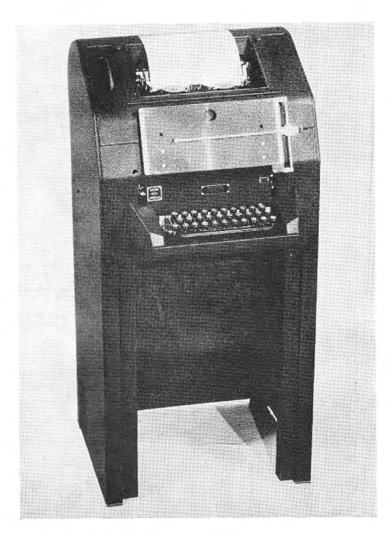
FIGURE 1—The new lightweight Model 15 Teletypewriter.

The principal differences aside from the cabinet are the replacement of the cast iron frames of the printer with cast aluminum, and the combining of the base and keyboard into one unit. Other changes include increasing the size of the dashpot and carriage return spring, elimination of the polar relay, and reduction of the size and weight of the type basket and many of the component parts. These changes have made