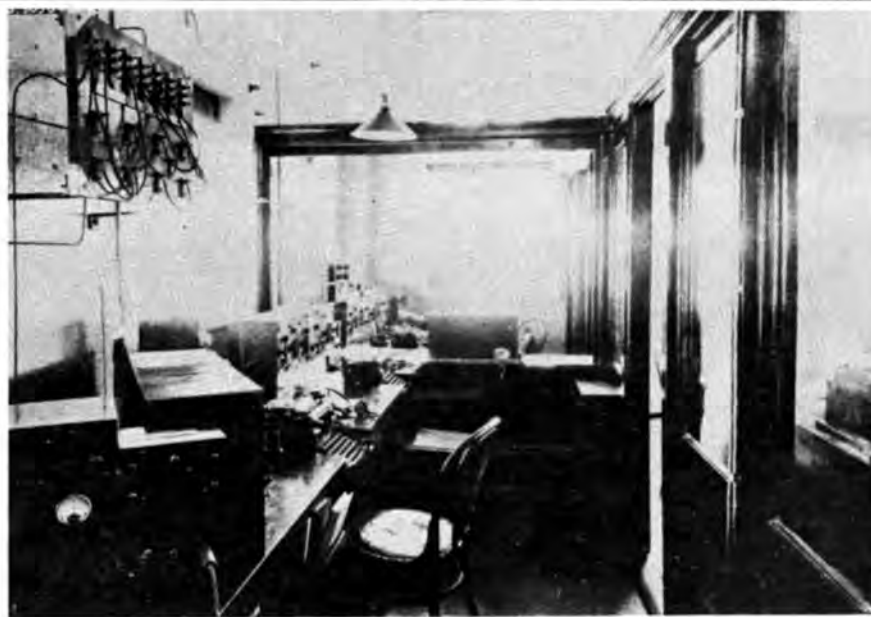
NBA, BALBOA, OPERATING POSITIONS, LOOKING SOUTH IN THE GLASS ROOM. FIRST RECEIVER, WITH A VOLTMETER SHOWING WAS AN SE1420 (IP 501) ONE OF TWO AT THE COMM'L SHIP'S POSITION. NEXT POSITION WAS NAVY SHIP'S CIRCUIT. THEN FLEET BROADCAST POSITION AND, ON THE FAR BOOTH, NSS AND NAZ. THE CONGLOMERATION OF WIRES ON THE SLATE SLAB ON THE BULKHEAD WAS BUILT (BY ME) TO REPLACE THE GREAT KNIFE BLADE ANTENNA GROUNDING SWITCHES THAT HAD BEEN MOUNTED ON THE WINDOW CASINGS. WHEN TROPICAL LIGHTNING PREVAILED THESE SPDT SWITCHES WERE TO BE THROWN BY THE OPERATORS TO THE GROUND POSITIONS. TWO MEN WERE BURNED BY LIGHTNING AS THEY HELD THE BLADES HALFWAY FROM GROUNDING. THE SEVEN ANTENNAS WERE CONNECTED TO THE TOP ROW OF POINTED BRONZE STRAPS - THE HORIZONTAL SLAB AT THEIR POINTS WAS GROUNDED. THE RECEIVERS CONNECTED TO THE LOWER TEN BLOCKS. FIRE FROM LIGHTNING WOULD HISS AND BUZZ FROM POINTS TO GROUND. "NBA" WAS INDEED A WELL KNOWN STATION AS ALL SHIPS OF THE WORLD TRANSITTING THE PANAMA CANAL WOULD FURNISH ARRIVAL TIME/DATE AND OTHER BUSINESS THROUGH THE "NBA" STATION.