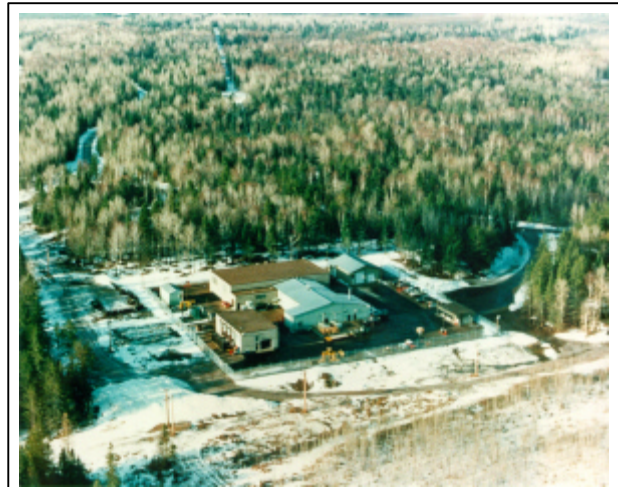
Clam Lake, Wisconsin ELF transmitter site

ELF communications systems make use of a principle in physics where the attenuation of radio signals (electromagnetic waves) from seawater increases with the frequency of the signal. This means that the lower the frequency a radio transmission, the deeper into the ocean a useable signal will travel. Radio waves in the Very Low Frequency (VLF) band at frequencies of about 20,000 Hertz (Hz) penetrate seawater to depths of only tens of feet. The Navy’s ELF system operates at about 76 Hz, approximately two orders of magnitude lower than VLF. The result is that ELF waves penetrate seawater to depths of hundreds of feet, permitting communications with submarines while maintaining stealth.