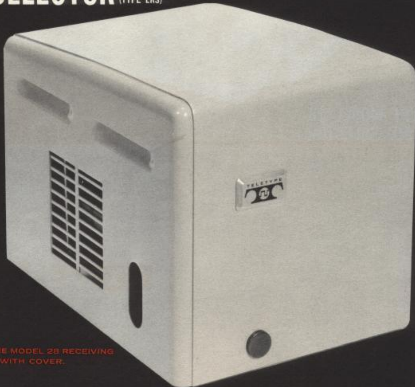
VIEW OF THE MODEL 28 RECEIVING SELECTOR WITH COVER.

Teletype applications specialists are at your service for more information on the Model 28 Receiving Selector. Get in touch with them soon.